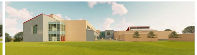
View from Basket Ring Road (Note: Perimeter trees have been removed)