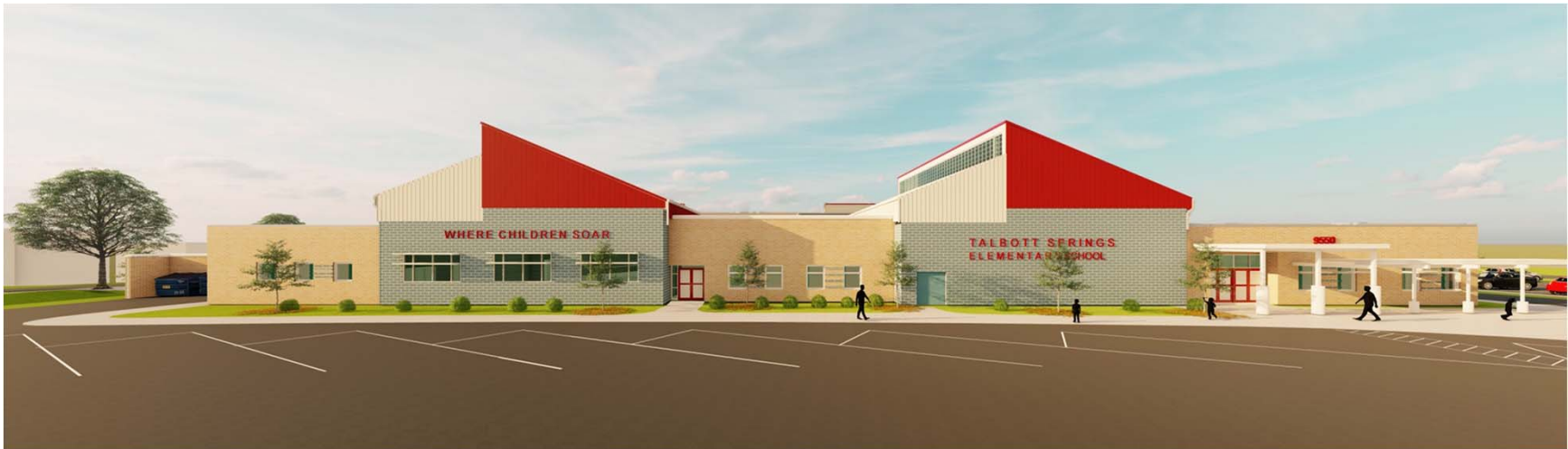
View from Whiteacre Road