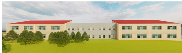
View from Holly Court Community (Note: Perimeter trees have been removed)