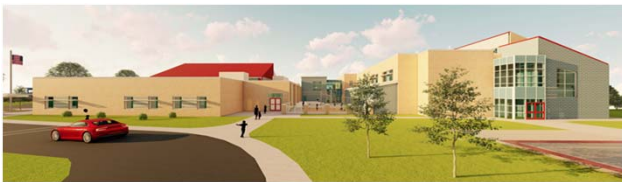
View from Existing School